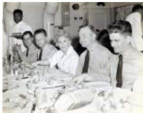
Eva Gabor during the filming of "Don't Go Near The Water", Long Beach, CA, June, 1957